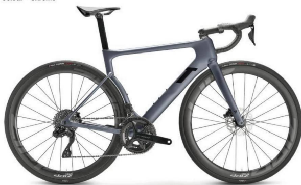
Colour - Charcoal