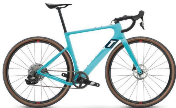
Colour - Light Blue