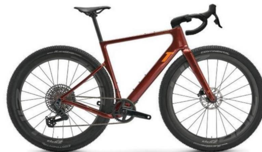
Colour - Terra