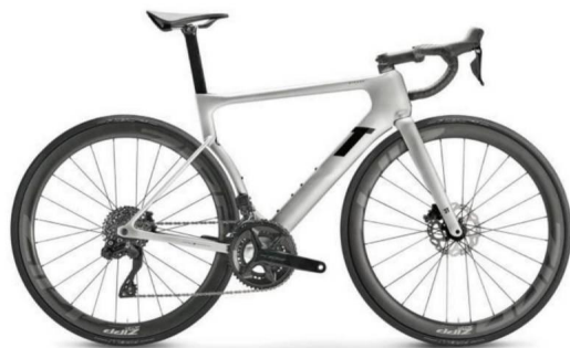
Colour - Chrome