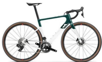
Colour - Emerald/White