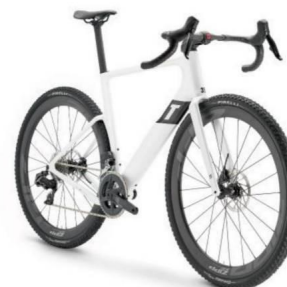
Colour - Bianco