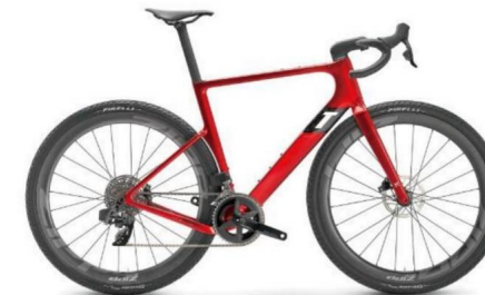
Colour - Rosso