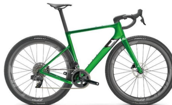
Colour - Verde