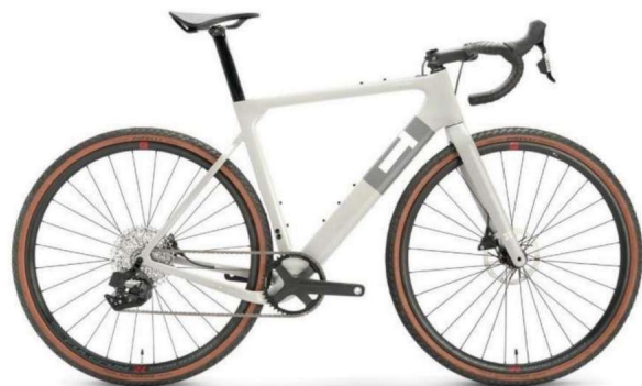
Colour - Grey