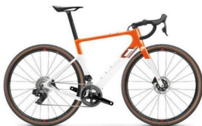
Colour - Orange/White