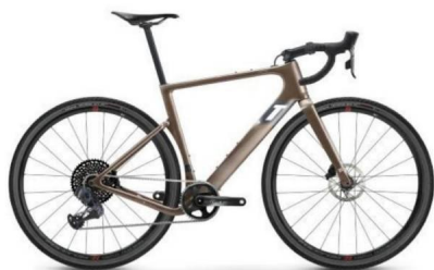
Colour - Coffee