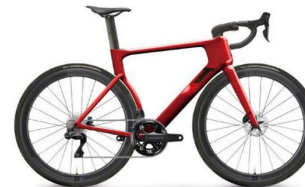
Colour - Rosso