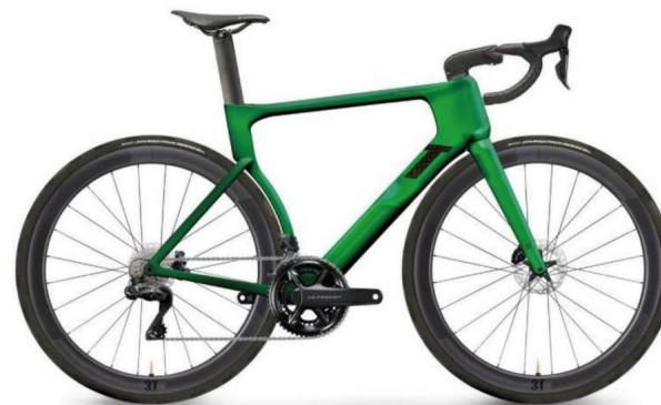
Colour - Verde