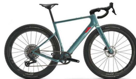
Colour - Mercurio