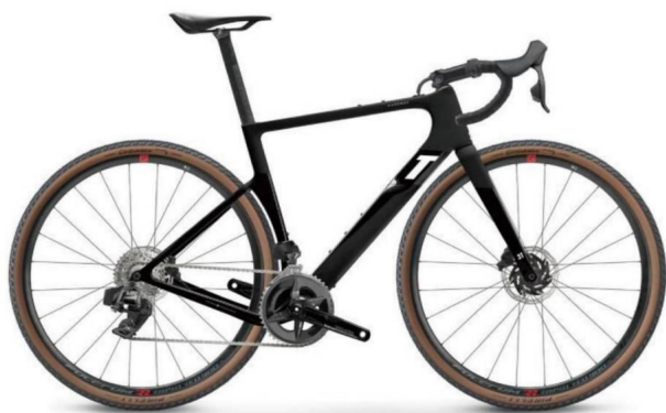
Colour - Black/Stealth