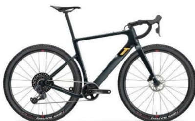
Colour - Graphite