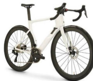
Colour - Bianco